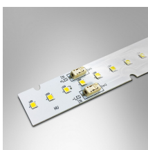
LED Strip Module