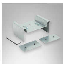
Luminaire connector (continued)